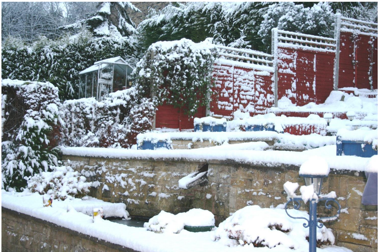
My Three Ponds in a January of past years

There are many myths about how to overwinter pond fish. For example – water gardening books will say ‘stop feeding from November to March’ or ‘shut down the filter system’. My ponds were running for 25 years and I have found these directives - and more - to be wrong. I used to let the fish decide when they no longer wanted food, which may, in milder years, be December, and feed again when they rise to look for some food, which can be February.