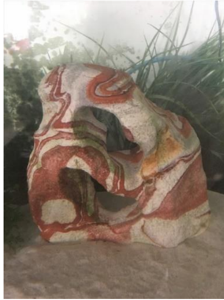
After (returned to tank)