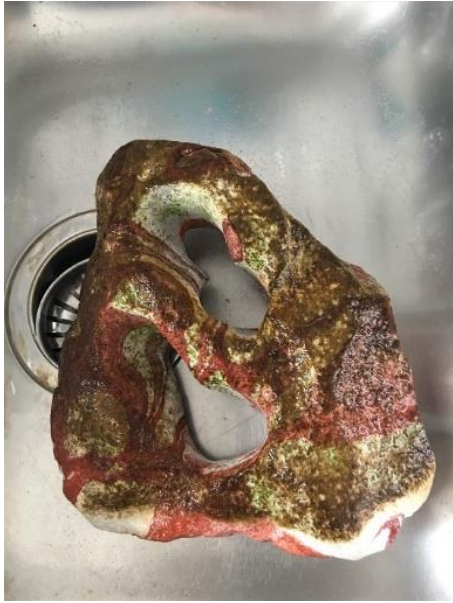
Before (in the sink)