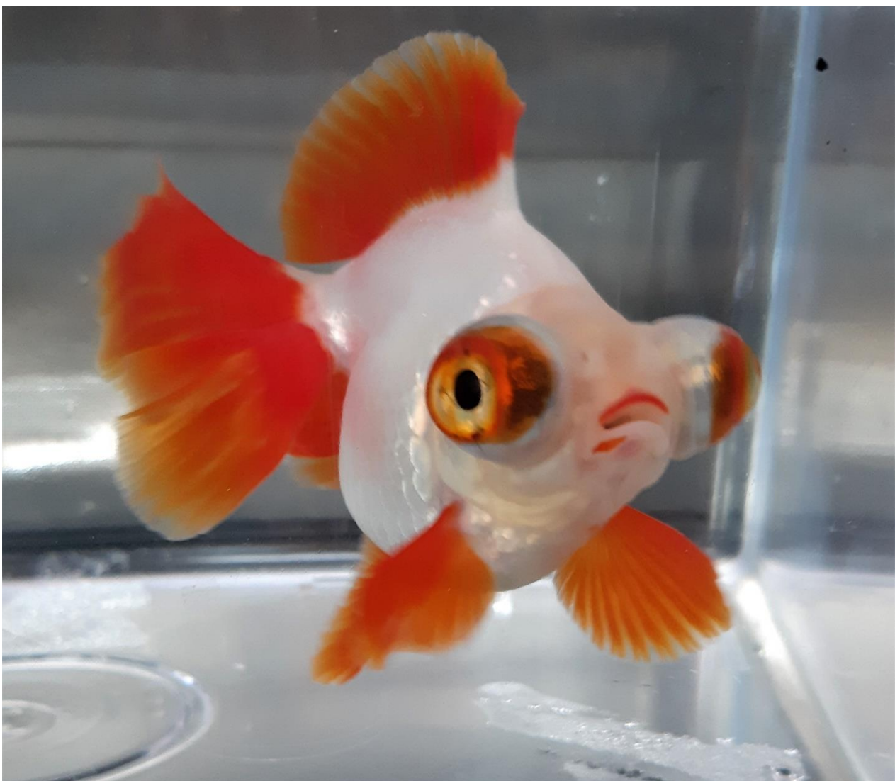
An AOV Goldfish!

(seen at AMGK's OS & Auction in Coventry June 29 th 2019)